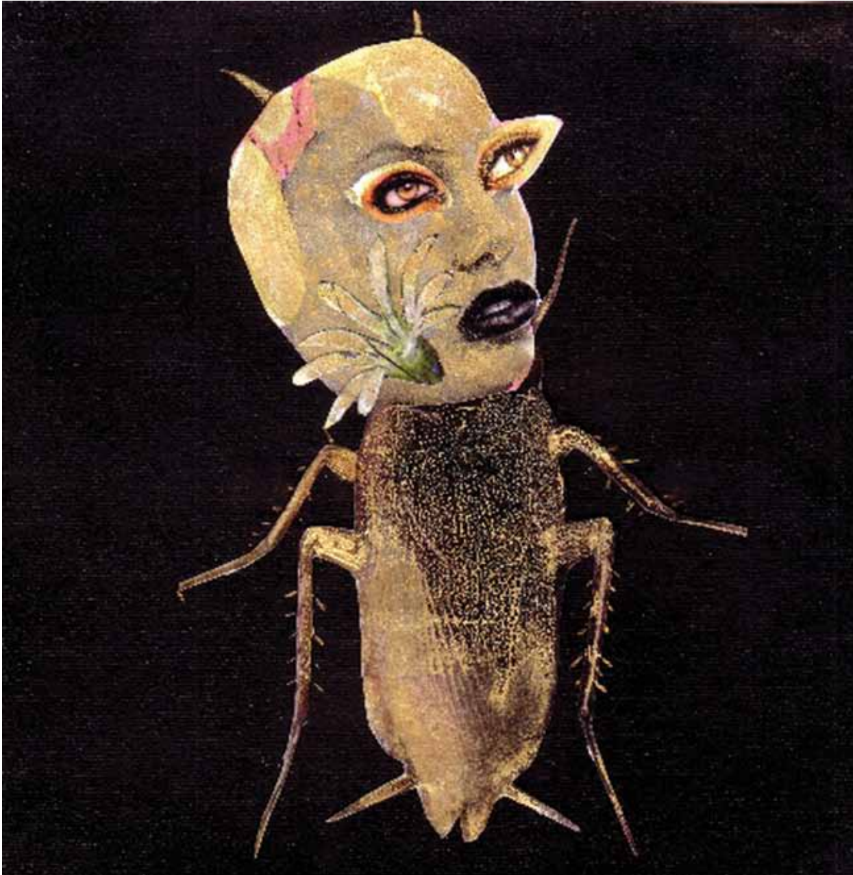
UNTITLED | 17 X 17 CM | MIXED MEDIA ON CARTON | 2012