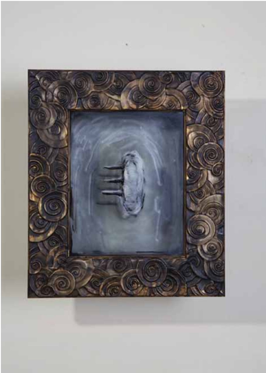
UNTITLED | FROM THE "SELF DEFENCE SERIES" | MIXED MEDIA (GLASS, WOOD MAGNET | 20 X 40 CM | 2011