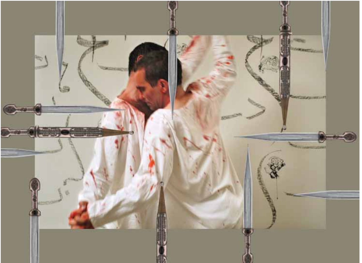
ENDLESS | 74 X 101 CM | DIGITAL PHOTO COLLAGE | 2009-2010