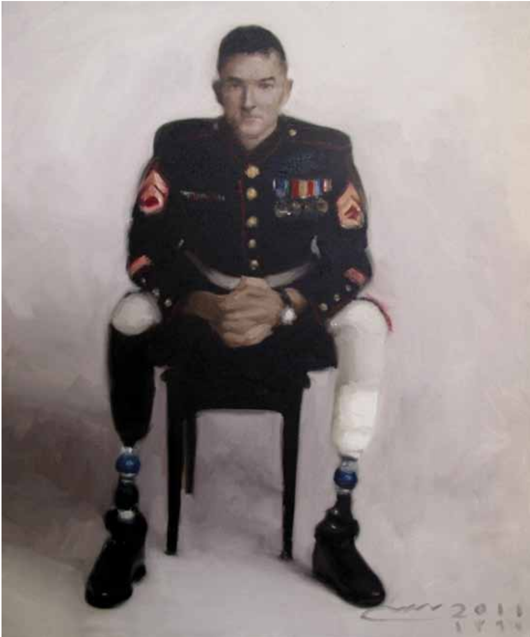
UNTITLED | 60 X 50 CM | FROM BEFORE, WAR, AFTER SERIES | 2011