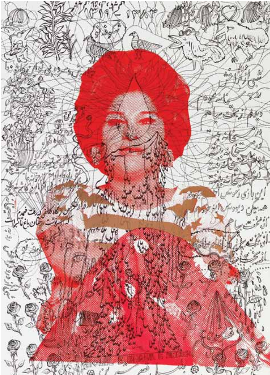
CHERRY BLOSSOMS | 120 X 90 CM | INK & SILK PRINT | 2011